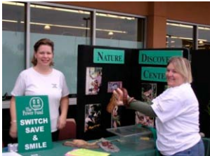
Snake brought to you by the Nature Discovery Center.

Adding to the festivities were one of METRO's downtown trolleys, Promised Land Dairy's Molly the Cow, a collection of art cars, the Texas International Dancers, and a West University Police Officer's Union barbecue. The Bellaire Honor Society helped to keep the event running smoothly. Many thanks go to the Nature Discovery Center, Whole Foods Market on Bellaire, and Office Depot, who helped plan and fund the event.