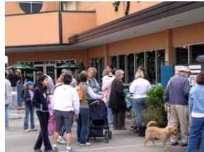
Area residents check out the Earth Day booths.