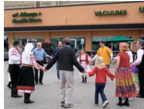
Whoopin' it up with the Texas International Dancers