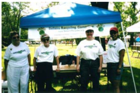
The Proud to Recycle rollout crew. The rollout crew posing in front of the prepared tent, ready to meet Bellaire residents.