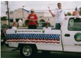
Ready for the parade. Recycling Committee members preparing for the parade.

Thanks to everyone that stopped by the Recycling Committee tent at the July 4 th Festival. With curbside recycling issues in the air, the tent was abuzz with discussion and even a few heated conversations. All in all, lots of questions got answered and many suggestions were heard.