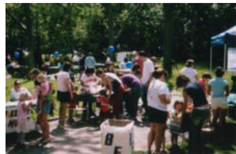
Earth Day / Spring Fling 2005 A big crowd enjoying the natural setting on a nice day at the Nature Discovery Center.

A fun, family festival, Spring Fling included children's crafts and activities, wildlife walks through Russ Pittman Park, and much more. At the Nature Discovery Center, the Bellaire Garden Club held its annual spring plant sale, and the Scholastic Book Fair took place in the Henshaw House. The North Harris County Dulcimer Society provided music while the Houston Storyteller's Guild entertained adults and children alike with nature-related stories. Also, the Texas International Dancers entertained at Whole Foods Market.